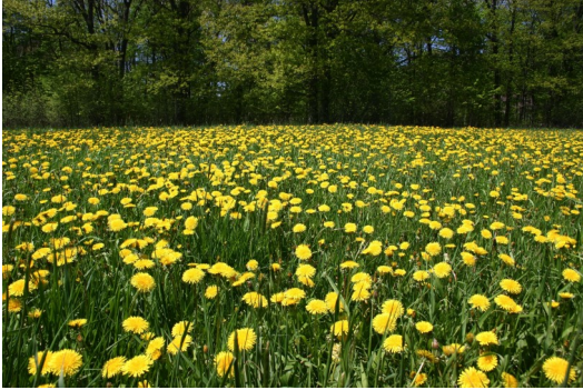
Common Dandelions Blooming in a Field --- and the street of the city is pure gold. Revelation 21:21b (NRSV)