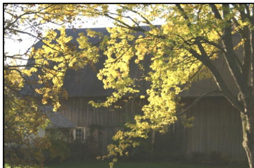
Silver Maple "Soft Maple" "White Maple" (Acer saccharinum)

http://www.kusemuseum-naturepreserve.org